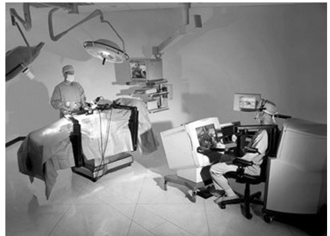
FIGURE 2. Zeus system set up.

The advantages of these systems are many because they overcome many of the obstacles of laparoscopic surgery (Table 1). They increase dexterity, restore proper hand-eye coordination and an ergonomic position, and improve visualization (Table 2). In addition, these systems make surgeries that were technically difficult or unfeasible previously, now possible.